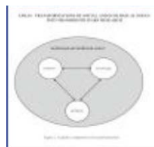
Figure 2: Cognitive components of research processes

We suggest, therefore, modeling sustainability research in a way that views it as a productive and innovative system as suggested in 1971 by Toernebohm and Radnitzky. According to this model, the research process proceeds in the form of a transformation of a complex web of problems, methods and knowledge. These latter form the dynamic components of a cognitive complex that is embedded in various institutional, cultural, communicative and intellectual contexts.