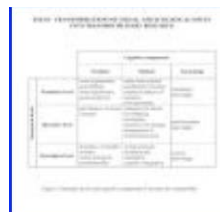
Figure 3 Structural levels and cognitive components of research for sustainability

As described above the discourse on sustainability is distributed across a normative level, an operative level and a descriptive level. In its cognitive dimension research processes proceed in the form of a transformation of a complex web of problems, methods and knowledge at each of these structural levels. If we distinguish analytically between these components we can construct a cross-table for the identification of cognitive activities in sustainability research. This table is a formal representation of a multi-dimensional topological problem-space on a twodimensional plane surface.