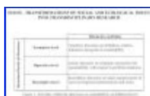
Figure 1: Activities within the discourse on sustainability on different levels

Jantschs model is a thoroughly top-down technocratic vision of the scientific world. For an appropriate understanding of the discourse on sustainability we have to give up this vision and we need to modify this model. In doing so we can distinguish analytically among three levels: a normative, an operational, and a descriptive level. In our scheme the normative level includes purposive activities, while the operational level is not restricted to technical solutions, and the descriptive level includes empirical, causal-analytical and conceptual inquiry and reasoning. The main difference between our scheme and Jantschs is that scientific and nonscientific activities are not ordered in a hierarchy but, instead, distributed unevenly over the various levels, depending on the purpose and the design of research. There is no center of control. The following topological model of the levels may be used either as a framework for observation or as a conceptual tool for the construction or reconstruction of research designs.